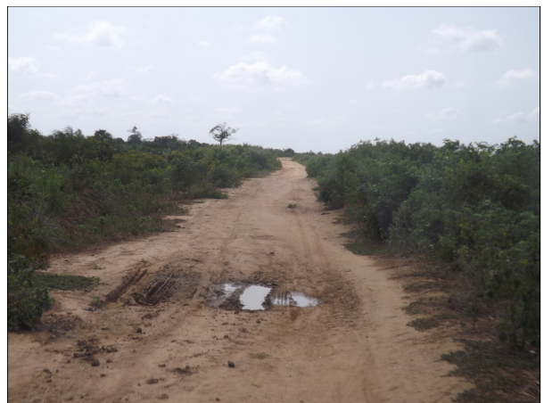
Our next trip to Ghana is scheduled for September 2105. Pray for our men to find the roads God expects to us travel down.