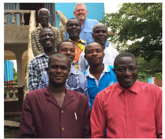
Our pastors in Ghana are now more functionally organized under the leadership of our Executive Leaders pictured here.