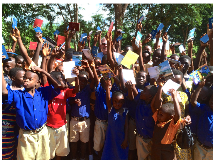
We shared the Gospel with over 67,000 individuals and gave bibles and scripture portions to almost all of these precious people. (Can you find Waldo in this picture?)