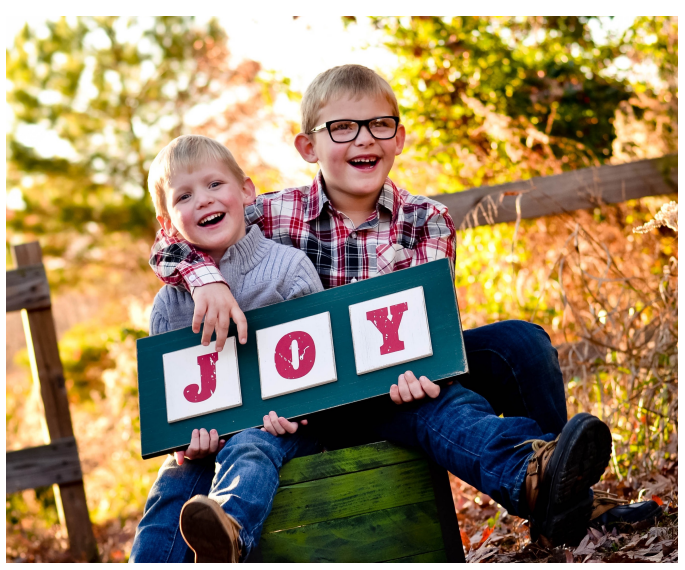
Not all that we accomplished was in Africa. These two grandsons bring untold joy to my heart. (Can you tell?)